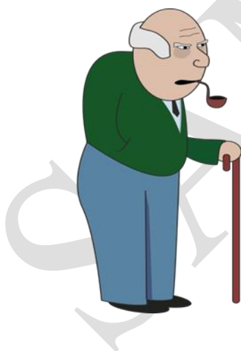
HELPING THE ELDERLY