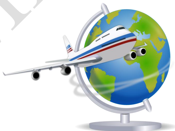
TRAVELLING ACROSS THE WORLD