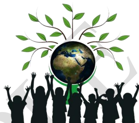
WILDLIFE CONSERVATION PROJECT